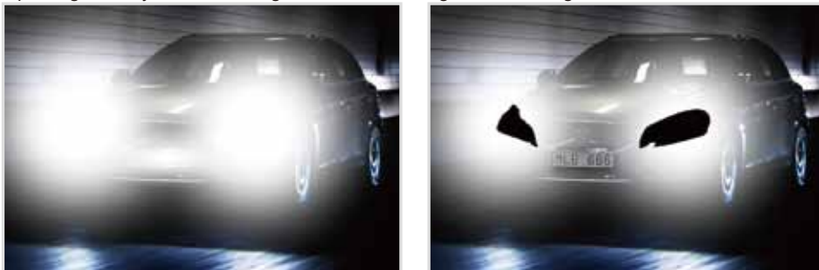
The actual images may vary depending on the mounting position and angle of cameras.

Improving visibility of overall image even in the strongest car headlights